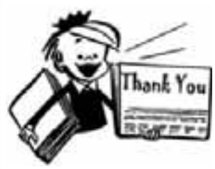
Letter to the editor, P7