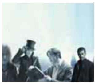
Surreal Careers, P3