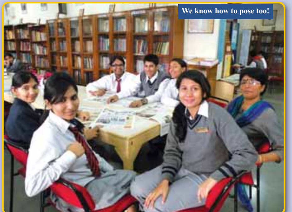
We know how to pose too!