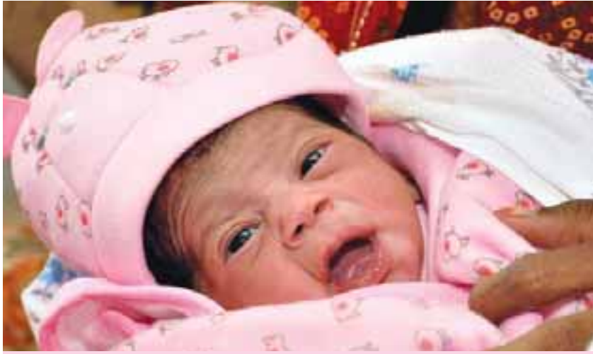
Wonder Baby Nargis: World's seven billionth baby, an Indian

Reaching the 7 billionth mark surely indicates that more people are living longer and enjoying healthier lives. But, with the number of people more than double of that in the last half-century, resources are under more strain than ever before. To some demographers especially India, the 7 billionth milestone forecasts turbulent times ahead; nations are struggling to grapple with rapid urbanisation combined with environmental degradation and skyrocketing demand for food, health care, education, and resources. Gaps between rich and poor are widening and more people than